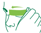
(Figure5) - Remove