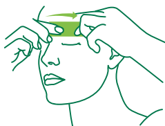
(Figure4) - Apply